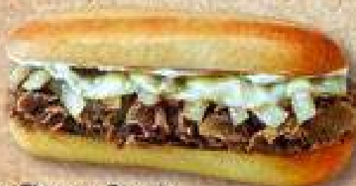
Philly Cheese Steak